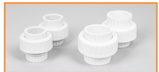
Union Connections (1-1/2" and 2" diameters)

E3T pool and spa heaters are compact, come standard with union connections, and are easy to install. They are the perfect solution for a new pool or spa, as well as to replace any existing pool or spa heater. Available in 5.5, 11, 18 and 27 kW.